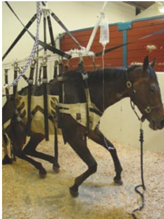
One of the typical neurological effects of EHV-1 infection is the "dog-sitting" posture reflective of pronounced weakness particularly in the hindlimbs.

EHV-1-induced neurological injury occurs when large numbers of the virus damage small blood vessels in the brain