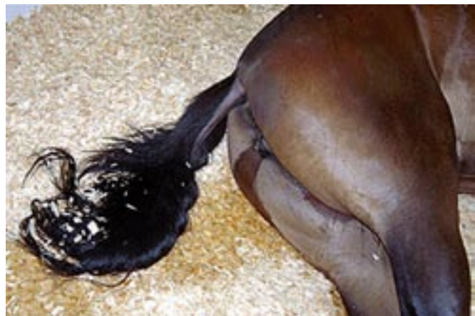
urine dribbling as well as difficulty in urinating and defecating.