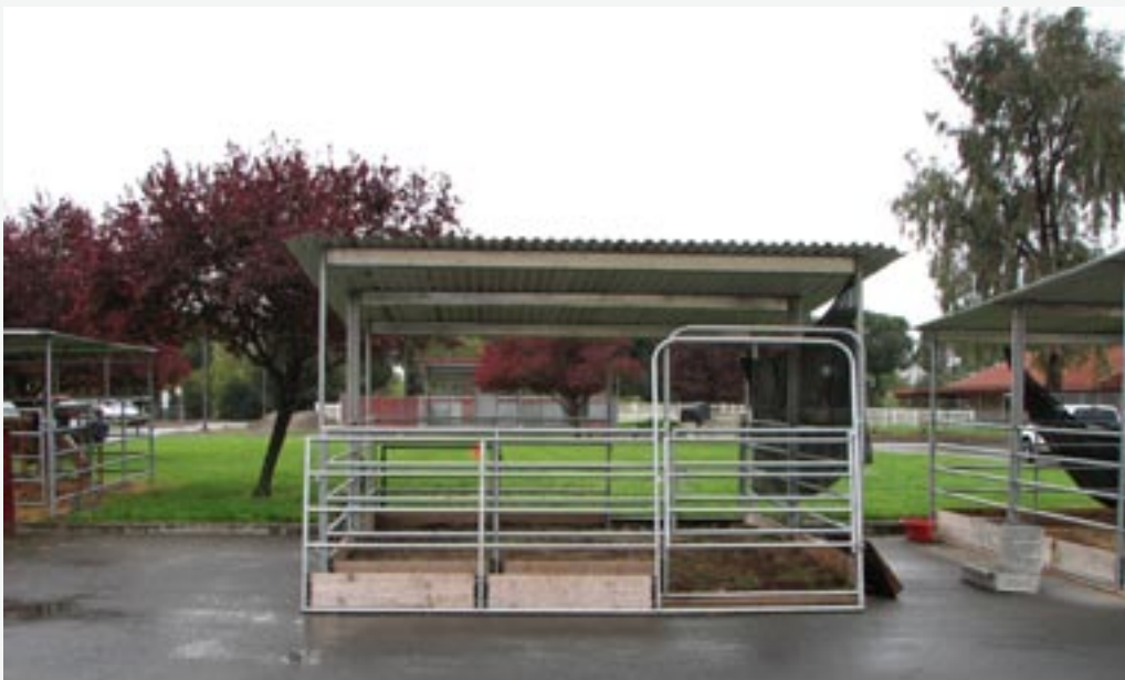
One of the isolation units at the UC Davis Veterinary Medical Teaching Hospital.

Treatment carts or smocks Painter's disposable coveralls Disposable gloves Rubber boots Foot bath containers Garbage bags Garbage cans with secure lids Disposable plastic shoe covers Thermometer for each horse Equipment for each horse (drugs in sealed plastic container for that horse, stomach tube, twitch, lip chain, etc.)