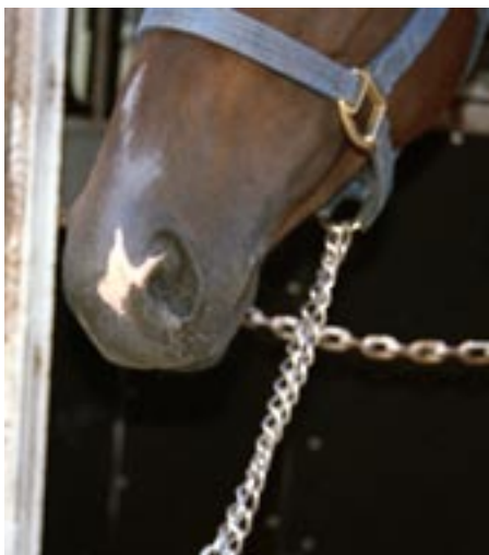
Clinical signs of neurological EHV-1 infection may include combinations of fever and respiratory symptoms of mild nasal discharge plus or minus a cough.