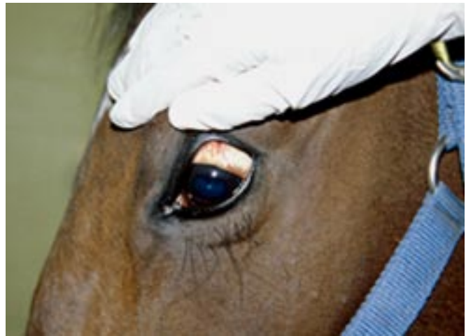
Other signs include redness of the sclera or conjunctiva,

Until such time as a vaccine is developed to protect horses from the neurological form of EHV-1, the best way to prevent the spread of disease is through isolation, quarantine and the practice of biosecurity—a series of management steps taken to prevent the introduction of infectious agents into a herd. All of these preventive measures are discussed in the following sections. ❄