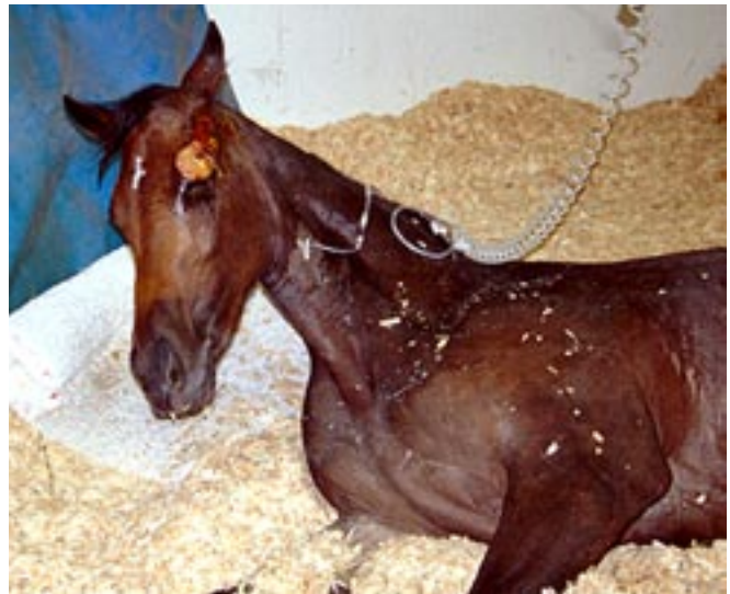
incoordination, weakness and difficulty in standing, and