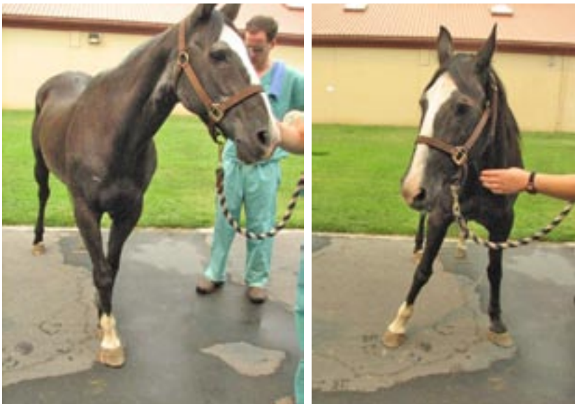
Misty when she presented to the UC Davis Veterinary Medical Teaching Hospital. Note the abnormal feet placement (abnormal proprioception).

Misty's neurological status was abnormal and included head tilt, unilateral facial paresis, bilateral decreased skin sensation over the entire body, incoordination, and a gait that ranged from hypometric (decreased range of motion) to hypermetric (exaggerated range of motion).