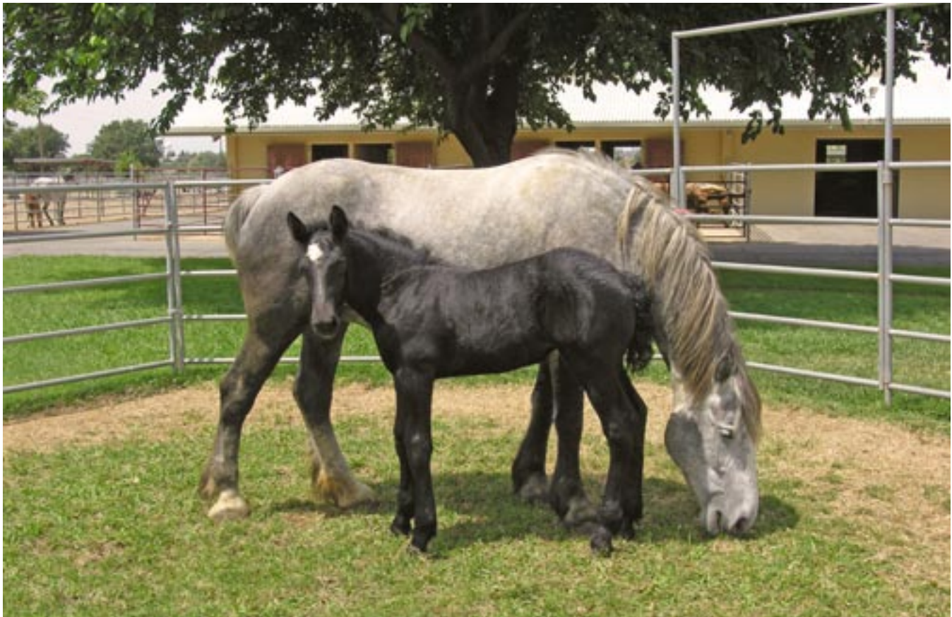
One of the mares and foals being followed in a UC Davis study of vertical transmission of the protozoal parasite Neospora hughesi .