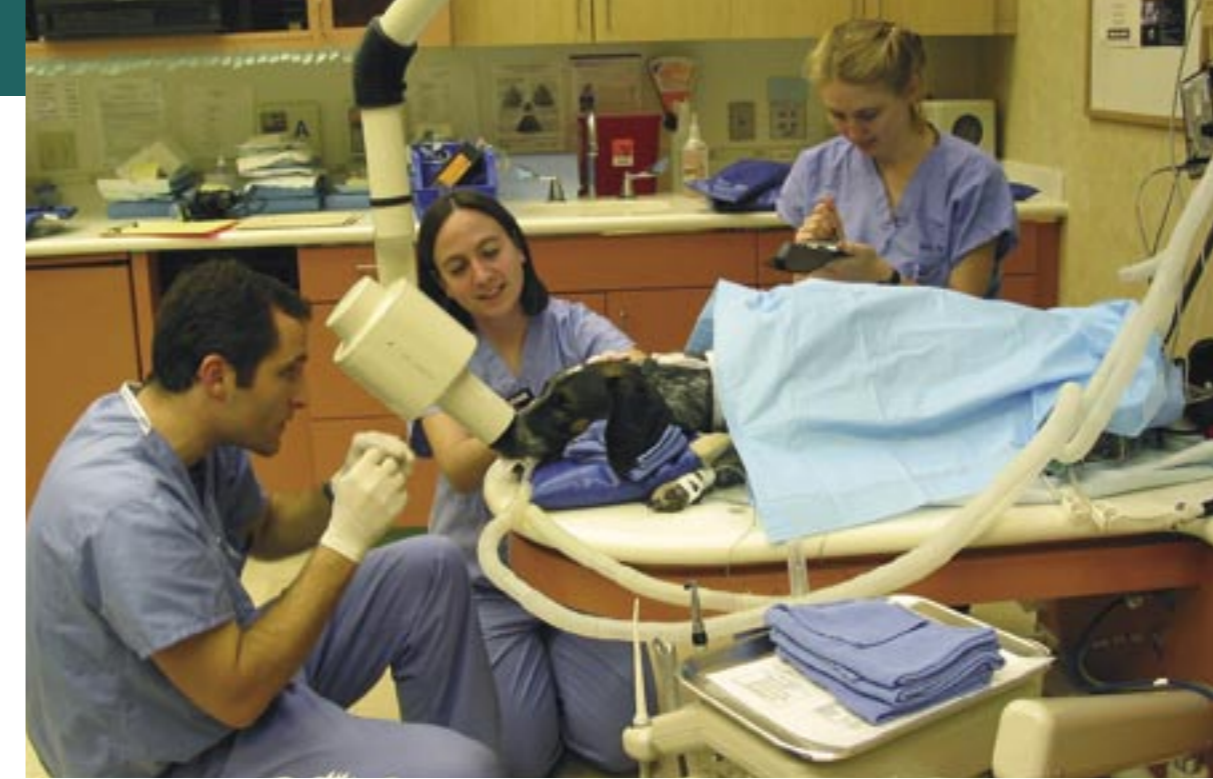
A canine patient gets a full set of dental x-rays. Each patient has a dedicated anesthetist (right) who constantly monitors heart rate, breathing and anesthesia level throughout the entire examination and cleaning.

Right: Every tooth is carefully examined—for plaque, calculus, gingivitis and mobility—and charted before cleaning or treatment begins.