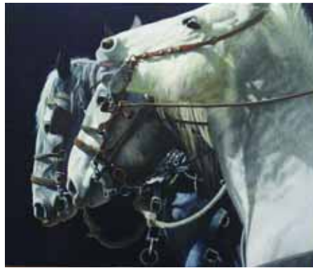
Team Plus One