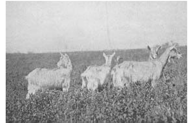
Toggenburg does at "University Farm" Davis, CA 1918

And... California Dairy Herd Improvement Association Tester Training Program