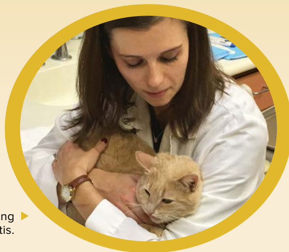
The veterinary hospital treats more than 5,000 cats per year, including Piglet who was treated for feline chronic gingivostomatitis. ►

With the broad array of health specialties located in one place, cat owners are well served by the veterinary hospital and its teams of experts.