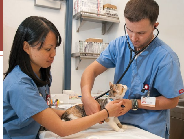
The school’s new curriculum promotes early and frequent exposure to clinical experience.